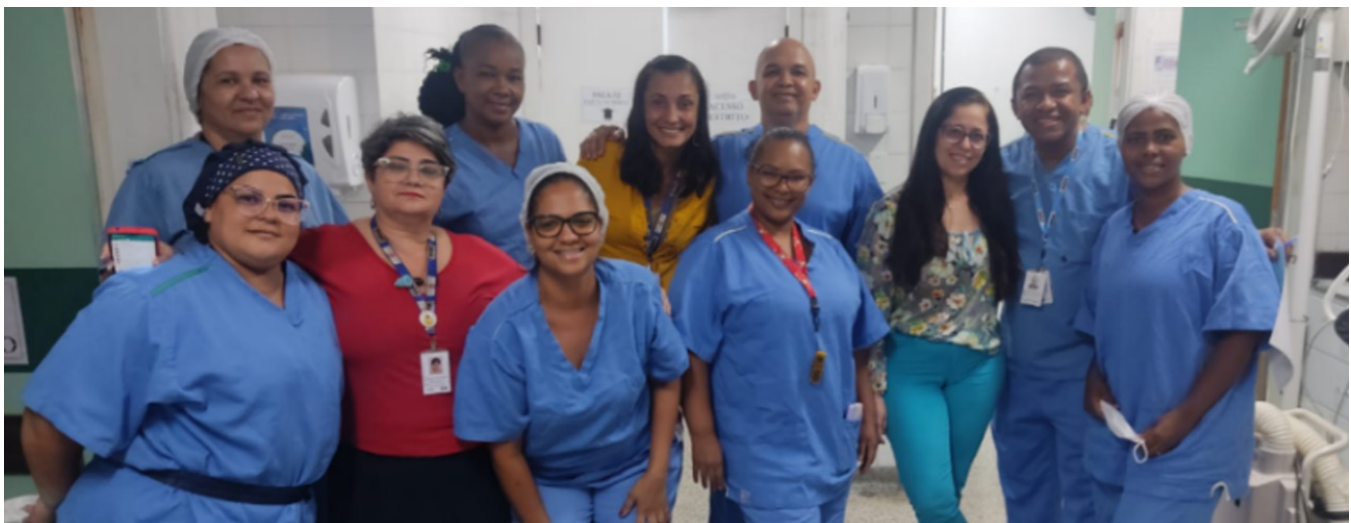
Photo: One of the Sociedade Beneficente Israelita Brasileira Albert Einstein teams in Brazil