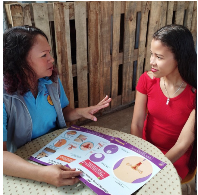
Photo: IOM staff member providing maternal health education

The program has had a significant, positive impact on key maternal and perinatal health indicators in the municipality. During the implementation period, the number of maternal deaths among migrant women declined to only one in 2023 from four in 2022. 27